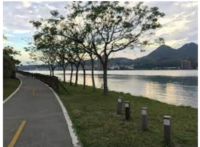
Golden River Bank biking Trail