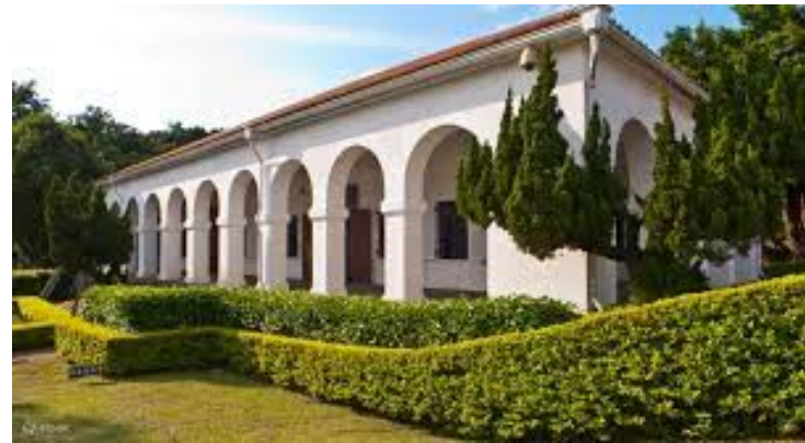
Some historical sites