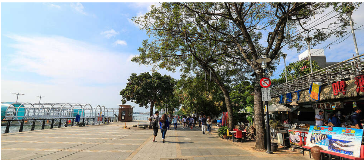
The Tamsui old Street